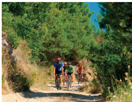
Podstranska ciklo-avantura / Bike-adventure in Podstrana