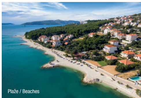
Plaže / Beaches