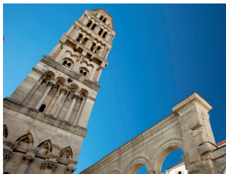
Zvonik Sv. Duje / St. Domnius Bell Tower