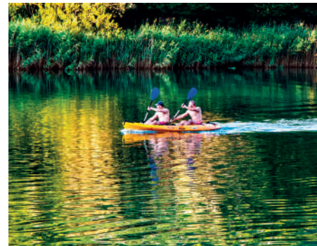
Aktivni odmor / Active vacation