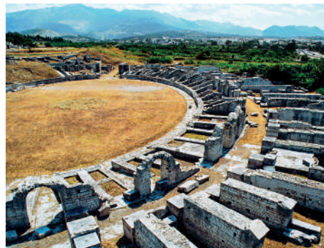
Amfiteatar, Salona / Amphitheatre, Salona