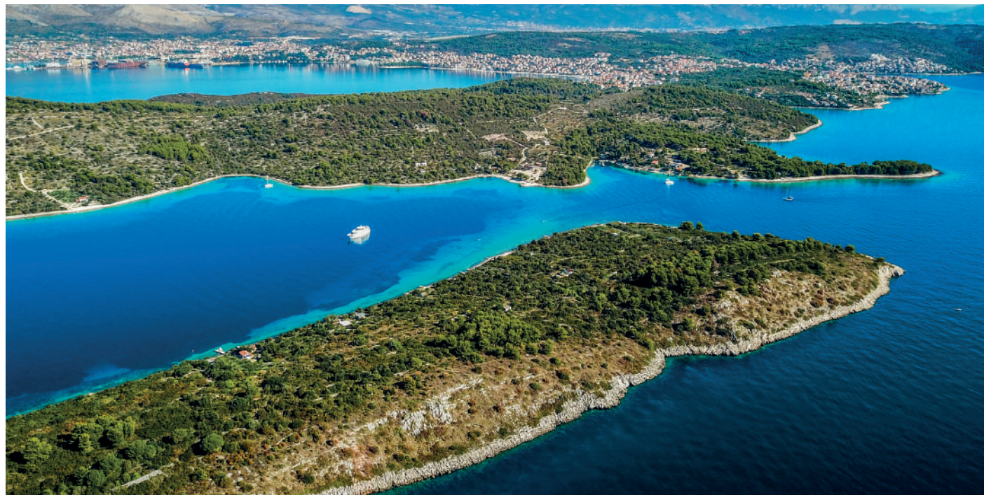
Otok Fumija / Fumija Island