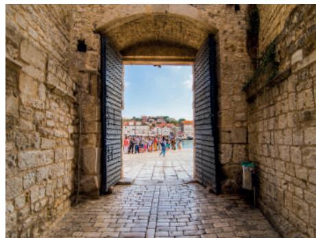
Južna gradska vrata / The southern gate of the town