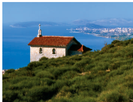
Kapela sv. Fabijana i Sebastijana / Chapel of St. Fabian and Sebastian