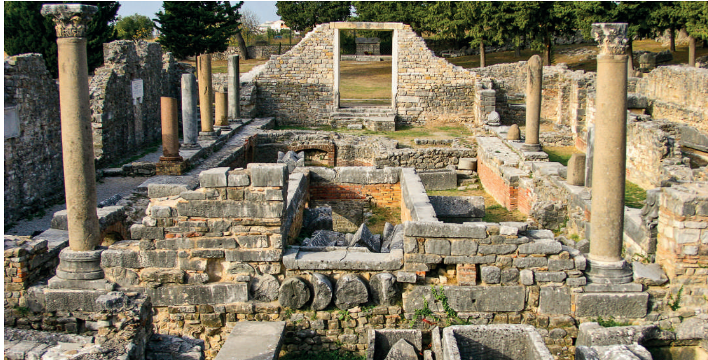
Manastirine - Salona / Old christian cemetery - Salona