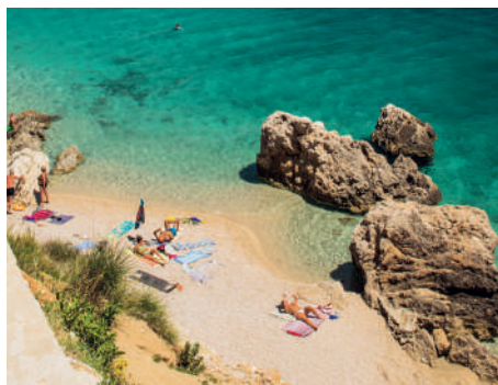
Plaža u Omišu / Beach in Omiš