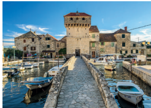
Kaštela Gomilica, Kaštilac – Game of Thrones location