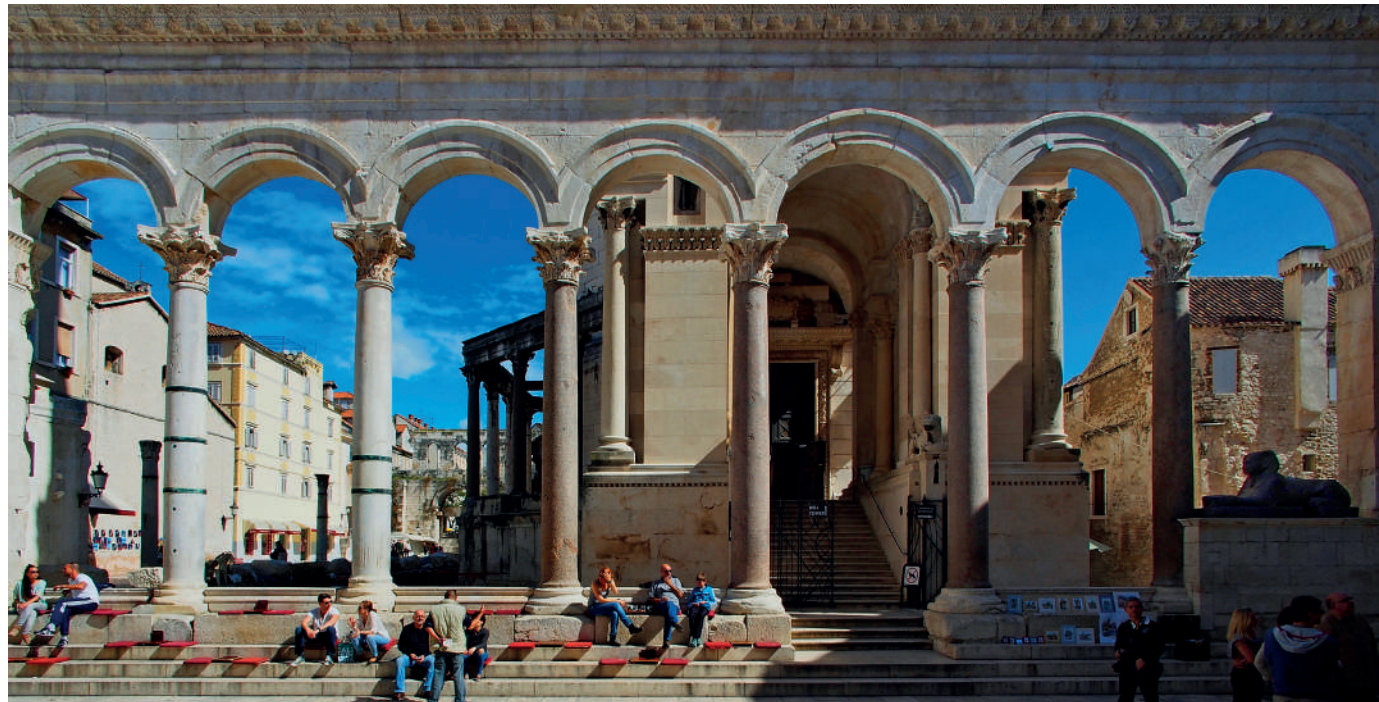
Peristil / Peristyle