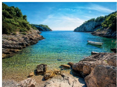
Uvala Jorja / Jorja cove