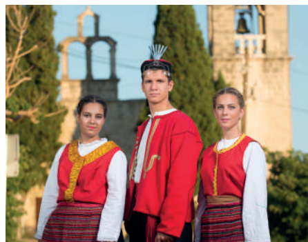
Etno - Gornja Podstrana / Ethno - Gornja Podstrana