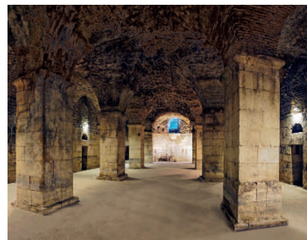
Dioklecijanovi podrumi / Diocletian's Cellars