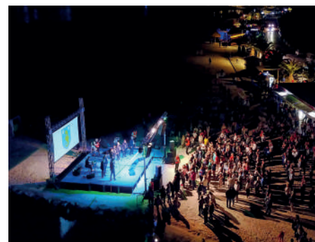
Okruške ljetne večeri / Okrug Summer Nights

📍 Bana Jelačića 15 21223 Okrug Gornji 🏠 www.visitokrug.com ✉ info@visitokrug.com ☎ 00385 21 887 311 📘 visitokrug 📷 visitokrug