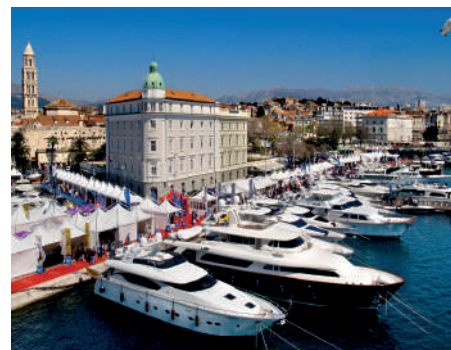
Nautika / Yachting

📍 Obala Hrvatskog narodnog preporoda 9, 21000 Split 🌐 www.visitsplit.com ✉ info@visitsplit.com ☎ 00385 21 348 600 📘 visitsplit 📷 visitsplit