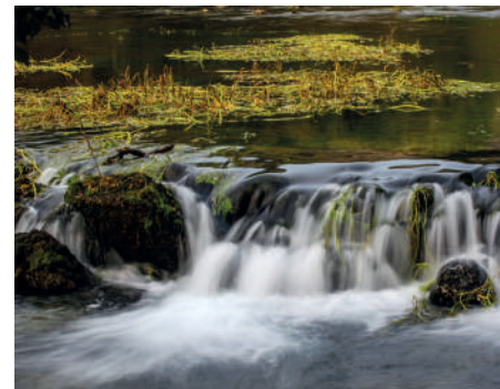
Rijeka Jadro / River Jadro