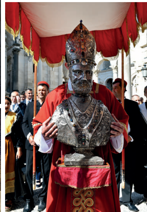
Sudamija / Saint Domnius Day