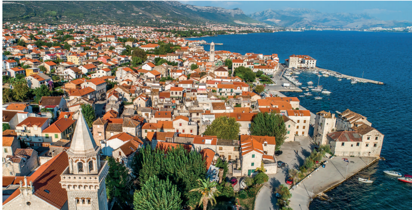
Kaštel Štafilčić & Kaštel Novi, Panorama / View