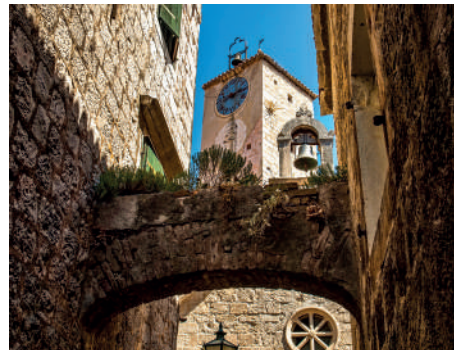
Crkva sv. Roka / St. Roch Church