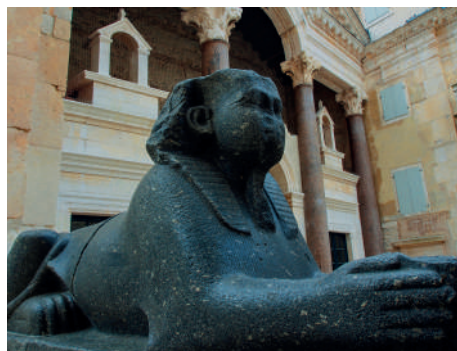
Sfinga / Sphinx