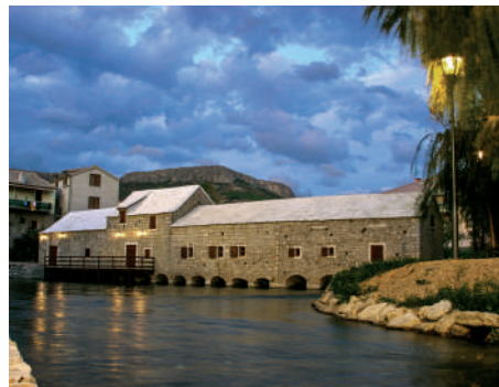
Gašpina mlinica / Gašpina watermill