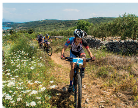
Rekreacija / Recreation

TROGIR turistička zajednica - tourist board