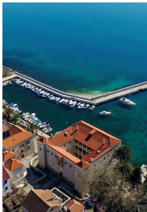
Kaštel Lukšić - Dvorac Vitturi & Muzej grada Kaštela / Vitturi Castle & Museum of the Town of Kaštela