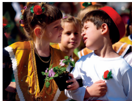
Kultura / Culture