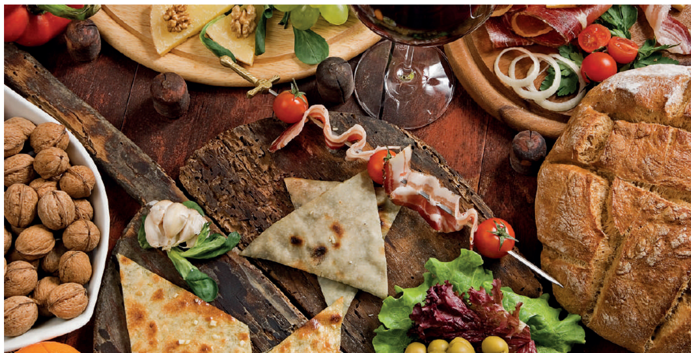
Podstranski jelovnik / At the table...