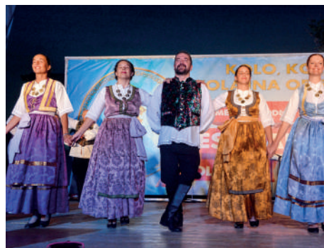
Dugoratsko ljeto / Dugi Rat Summer