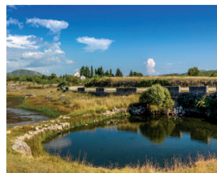
Lokva na Blizni / Puds in Blizna