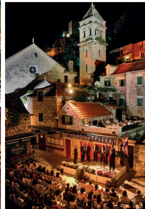
Festival dalmatinskih klapa / Dalmatian klapa festival