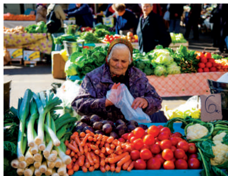
Gastronomija / Gastronomy