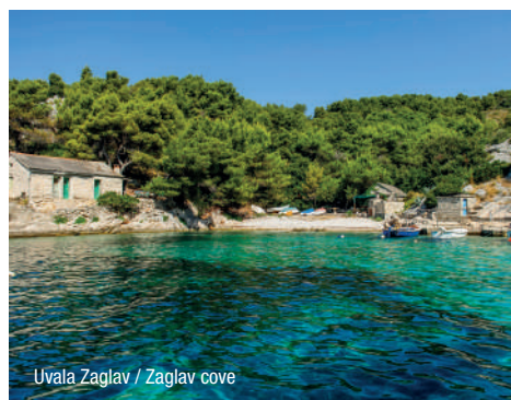
Uvala Zaglav / Zaglav cove