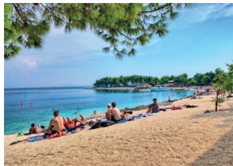
Plaža Labadusa / Labadusa Beach