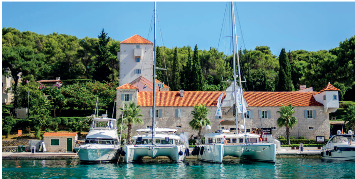
Maslinica: pogled na Martinis Marchi / Martinis Marchi view