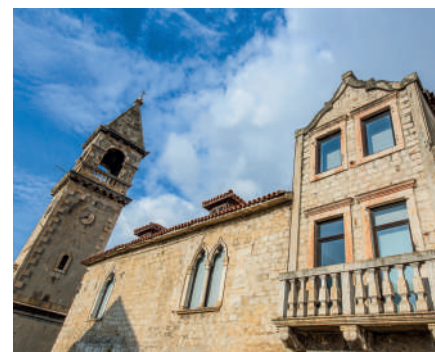
Kaštel Sućurac – Nadbiskupska palača & Muzej grada Kaštela / Archbishops palace & Museum of the Town of Kaštela