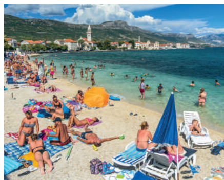
Kaštel Štafilčić Plaža Gabine / Gabine Beach