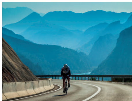
Aktivan odmor / Active vacation