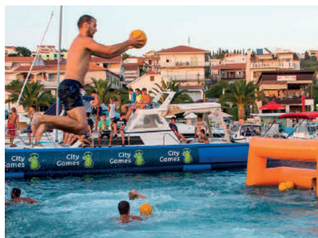
Jadranske igre / City Games