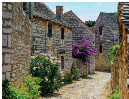
Grohote: Tradicijske građevine / Traditional architecture