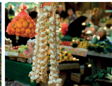
Tržnica / Market