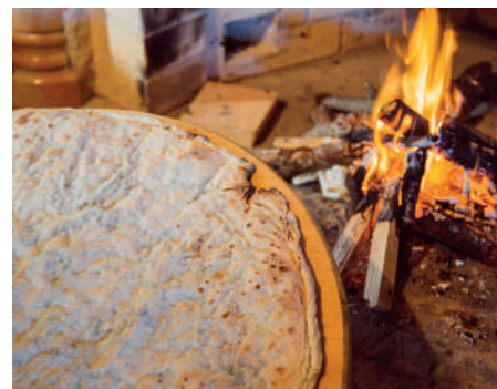
Soparnik, tradicionalno jelo / Soparnik, traditional dish