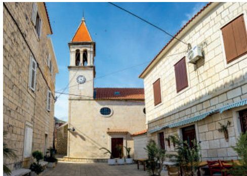
Crkva Gospe od Ružarija / Our Lady of the Rosary