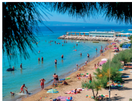
Pješćana plaža u Dućama / Sandy beach in Duće